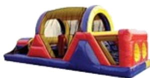
40' Obstacle Course

This obstacle course offers 40 feet of challenging obstacle entertainment. This inflatable play structure takes participants on a larger journey through tunnels, around horizontal and vertical pop-ups, with plenty of climbing and descending along the way!